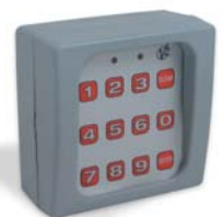
Wire Free Key Pad